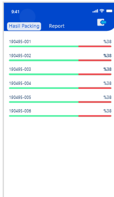
Fig 2.View Results