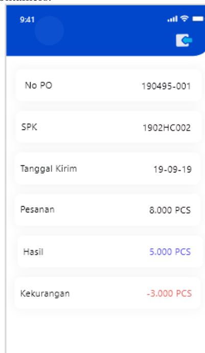
Fig 3.Result Details

Result details page serves to display detailed information about the data from the information presented, consisting of No. PO, SPK, date sent, number of orders, the result of the packaging, and the lack of packaging or goods not in containers.