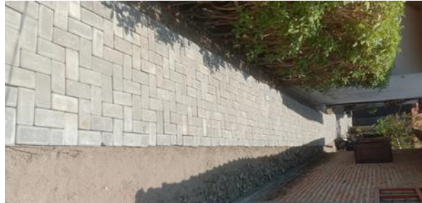
Figure 4 . Realization of Village Fund Accountability

following is documentation of an example of the realization of village fund accountability, namely the construction of paving in each RT ( Figure 1 ) as follows :