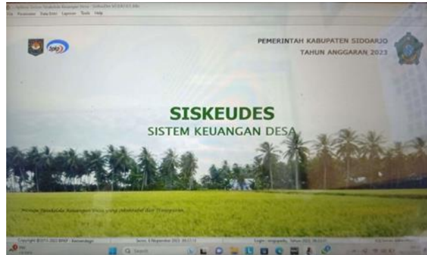
Figure 1 . SISKEUDES view