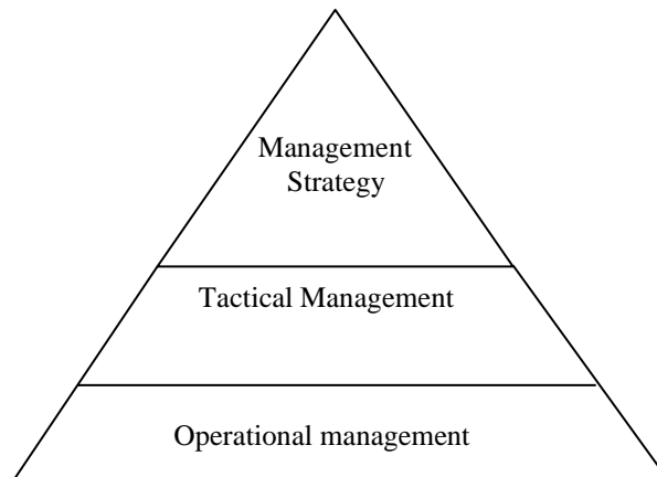
Figure1. Management Hierarchy

The decisions taken by the Manager may vary according to the level of Management. The following figure 2.1 describes the levels of management in the organization.