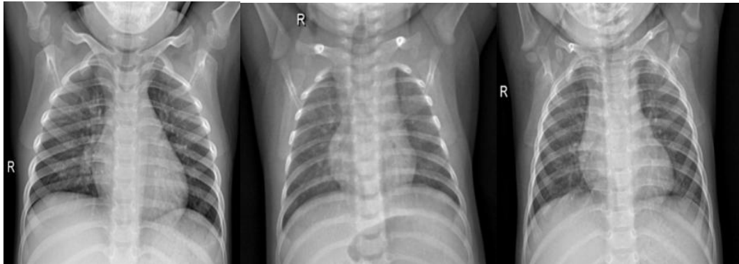
Fig 1. Normal Chest X-Ray Image