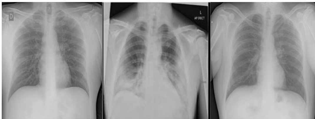
Fig 2. Covid-19 Chest X-Ray Image