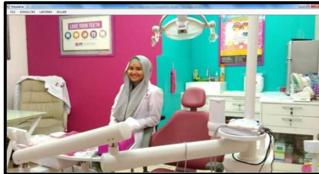
Fig 2. Main Menu