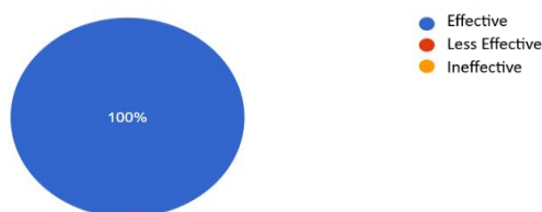
Diagram 2. The effectiveness of teaching campus programs

13. Is this teaching campus program effective enough to instill character values?