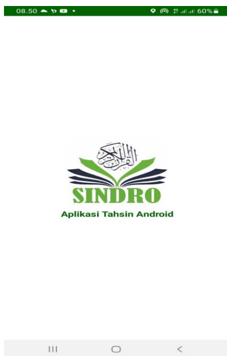
Figure 2. Intro page

The intro view is the loading screen for the SINDRO application (android tahsin) when we open the application. In the intro view, there is a splash screen that says SINDRO (android tahsin), which gives an interesting impression and notifies users that the application is called SINDRO (android tahsin).